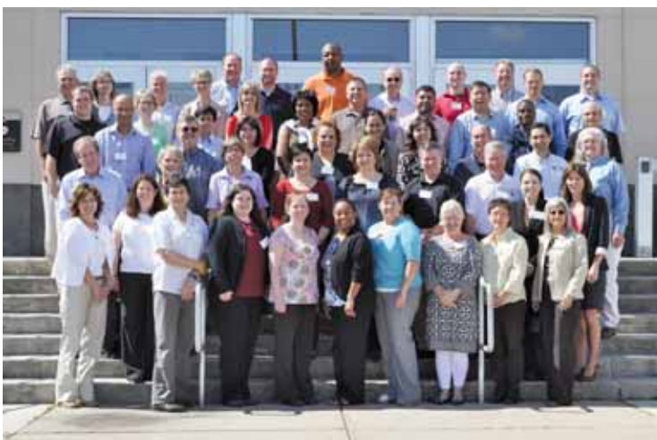
This year's global QA meeting was held in Maryland.

Congratulations to each of the winners—and their proud parents. All of us here at McCormick wish the students the very best of luck in their new academic adventures.