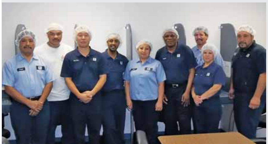
The other half of the winning Dallas team.