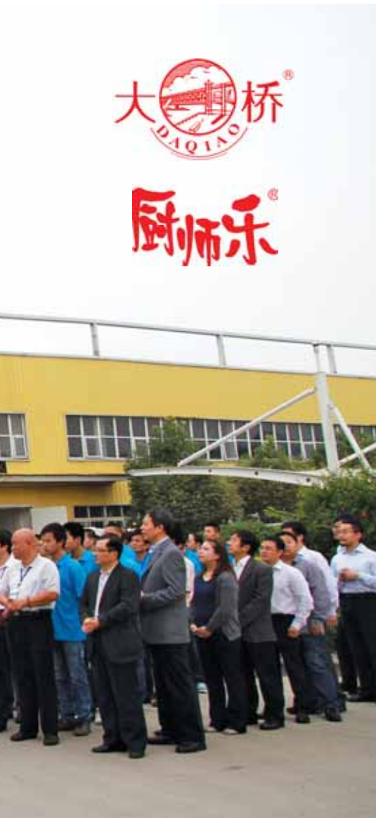
The spirit is obvious. Employees at the Wuhan facility in China bring passion to work everyday.

After the ceremony, the Wuhan local management team held their first presentation to the China Leadership team, introducing their work process and progress. A milestone acquisition had been completed.