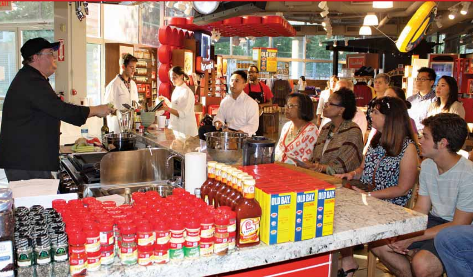
Cooking classes at McCormick World of Flavors: fun, educational and it tastes good too.