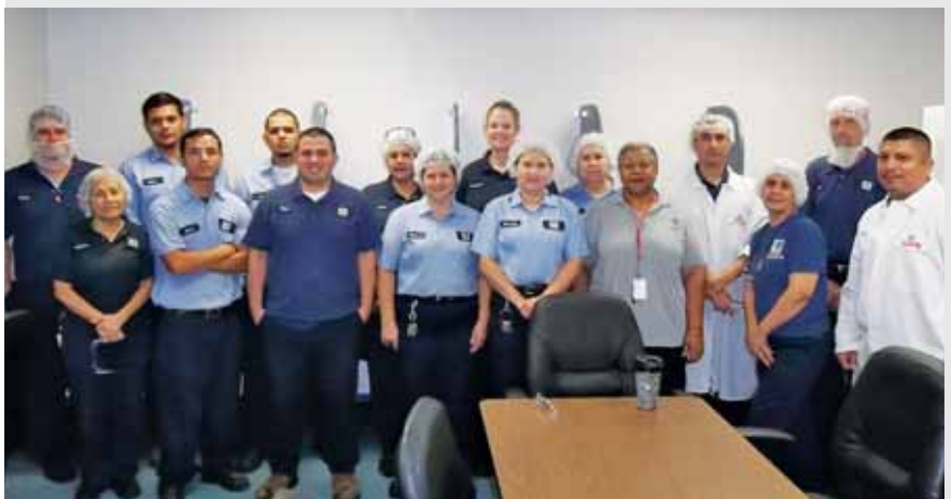
Half of the winning Dallas team.